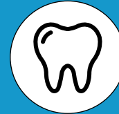
Medical & Dental