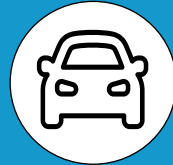
Car Repairs & Registration